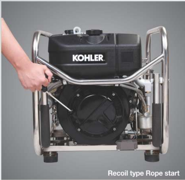
Recoil type Rope start